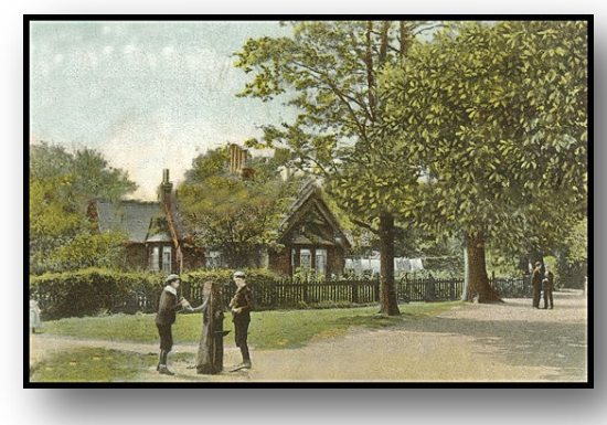
Keepers Lodge c. 1906